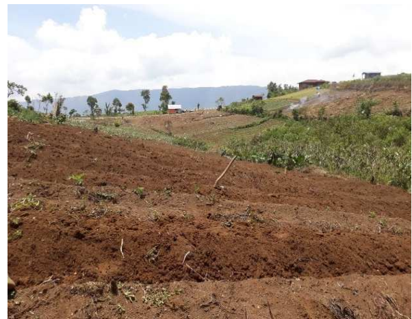
Figure 2. Photos of potato fields in the research location.

This research was conducted by means of a field survey in the potato production center area in the Upper Lembang sub-watershed. Samples were taken based on five groups of land units (Table 1). Based on the soil map, the potato production center area is dominated by two soil orders, namely Andisol and Inceptisol (Table 1). The study was conducted on V groups of farmers based on the physiography of the land, the groups are; groups I, II, III, IV and V. Group I is flat, II is slightly sloping, III is sloping, IV is flat, V is sloping. Therefore, it is the center of potato production. Soil samples taken are undisturbed soil samples with a ring sample for analysis of soil physical properties. For analysis of soil chemical properties, disturbed soil samples were taken using a Belgian soil drill.